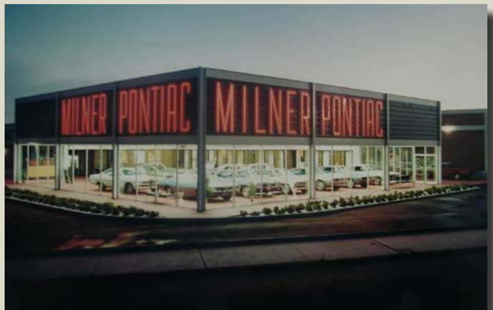
Photograph of the new Milner Pontiac location at 2111 East 11th Street in Tulsa, Oklahoma.

Roy's picture as it appeared in the "Pontiac Engineered Parts News" a newsletter that went out to all the Pontiac dealerships in the country.