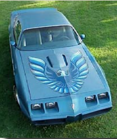
This 1979 Trans Am is one of the 2,988 Pontiacs sold at Premier during the 1979 model year.