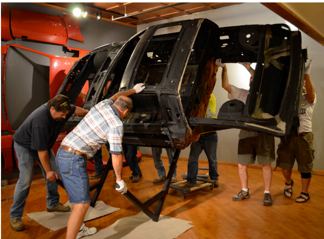
Lifting the Fiero chassis with help of city workers and unsuspecting museum visitors.

An additional feature of the display was stumbled on quite by accident. While scanning ebay for Fiero pieces to round out our Fiero display case I found