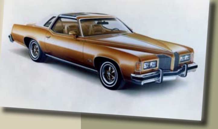
Photo of the 1976 Pontiac Golden Anniversary Grand Prix attached to memo sent to Pontiac zone managers.

This brings up an interesting point about the debut of this special car. POCI member Chuck Cochren provided some pictures from the 1975 POCI national convention held in Pontiac, Michigan August 22-24. It was